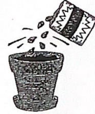
Seed planted in soil