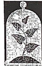
Stem growing leaves