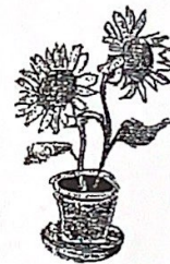
Fully grown flower